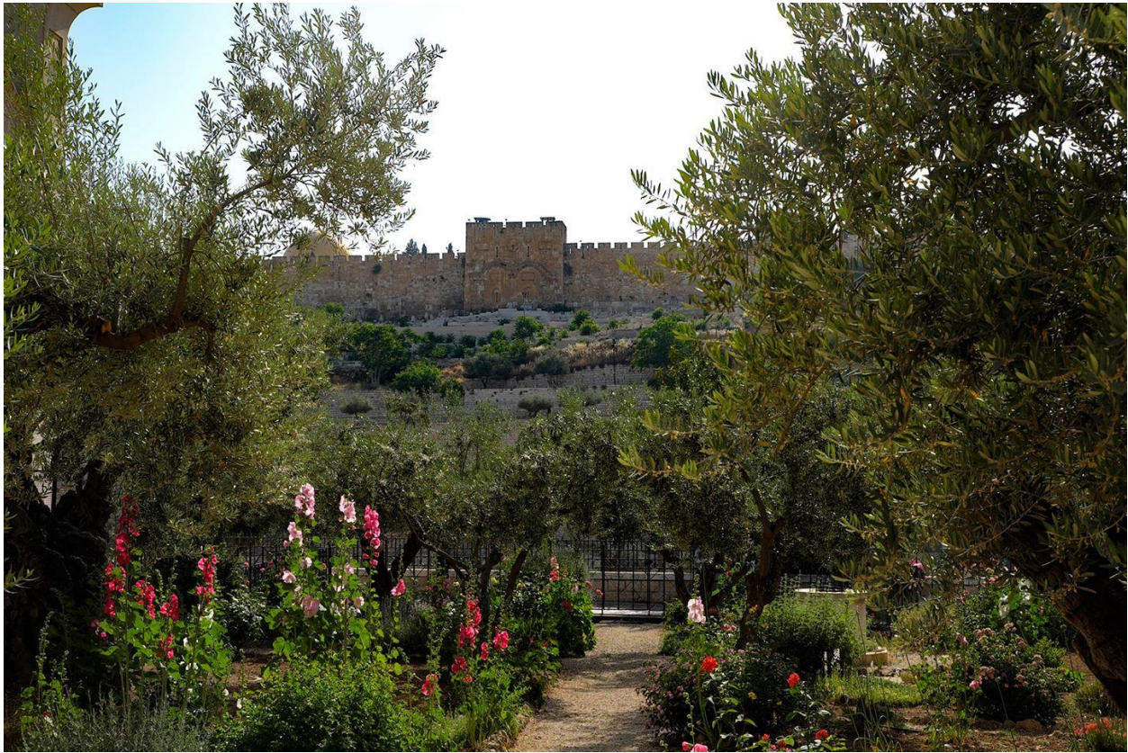
{ A view from the Garden of Gethsemane, across the Kidron Valley— Up towards the Golden Gate of Temple Mount! }