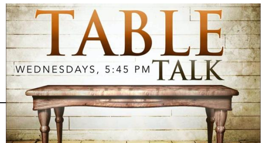
Table Talk Series: READING THE BIBLE AS A SINGLE BOOK Wednesdays, February 5, 12 & 19 at 5:45 p.m.

Have you ever felt overwhelmed with how long and diverse the Bible is? Do you struggle with seeing it as “one book” with a single message? Join us at Table Talk as we explore the unity of the Bible. We'll be meeting at the church at 5:45 p.m. on February 5, 12, and 19. This is a practical, hands-on series that will equip you to read through the Bible with greater understanding. You can expect to gain useful tools and resources that will make reading the Bible from cover to cover a more meaningful experience.