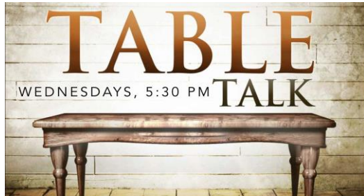
Table Talk Resumes Wednesdays, Starting September 19, 5:30 pm

This fall, we'll launch our Wednesday evening Table Talk by concluding our series of studies, Christian Faith and Other Faiths: Understanding and Outreach . We'll begin with The Church of Jesus Christ of Latter-Day Saints (LDS), more popularly known as the Mormons. We'll look first at the founding and the growth of the LDS. Then, following the pattern of our previous studies, we'll look at points of contact and points of conflict between the LDS and historic Christianity. We'll follow a similar outline in exploring the history, theology, and practices of the Jehovah's Witnesses.