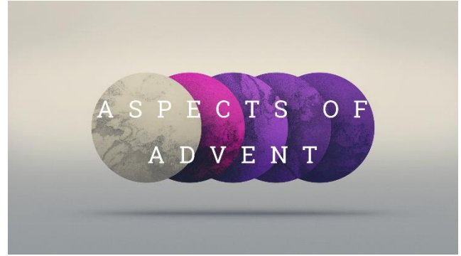
Table Talk Continues Nov. & Dec. Wednesdays 5:45 – 6:45