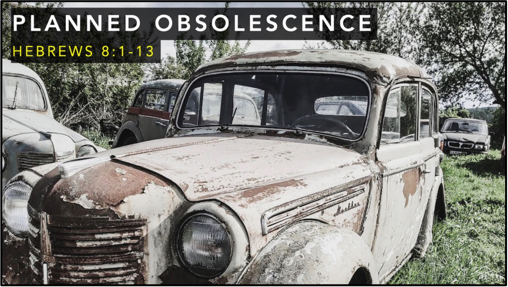
SERMON NOTES, JULY 23