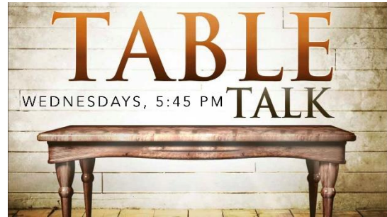
Table Talk Continues Christian Faith and Other Faiths 5:45 – 6:45